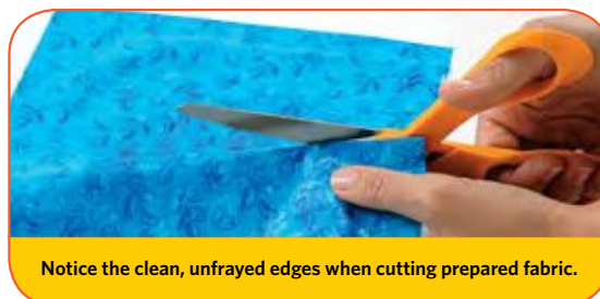
Notice the clean, unfrayed edges when cutting prepared fabric.

Allow the fabric to dry. This will enable you to cut the fabric like paper without worrying about frayed edges.